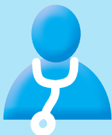
Health Care Providers