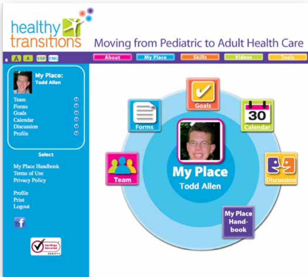
A sample My Place home page

Team members also share a calendar with an email reminder system and a goal-setting tool. The goal-setter tool fosters self-determination by prompting the youth to identify supports and set priorities during the transition process. A discussion area facilitates information sharing across systems of care (schools, day-habilitation programs, medical offices, family etc.). Team discussions are archived on the site and can be searched by topic and date. Individuals can print discussion topics for review by a physician or nurse during health care encounters.